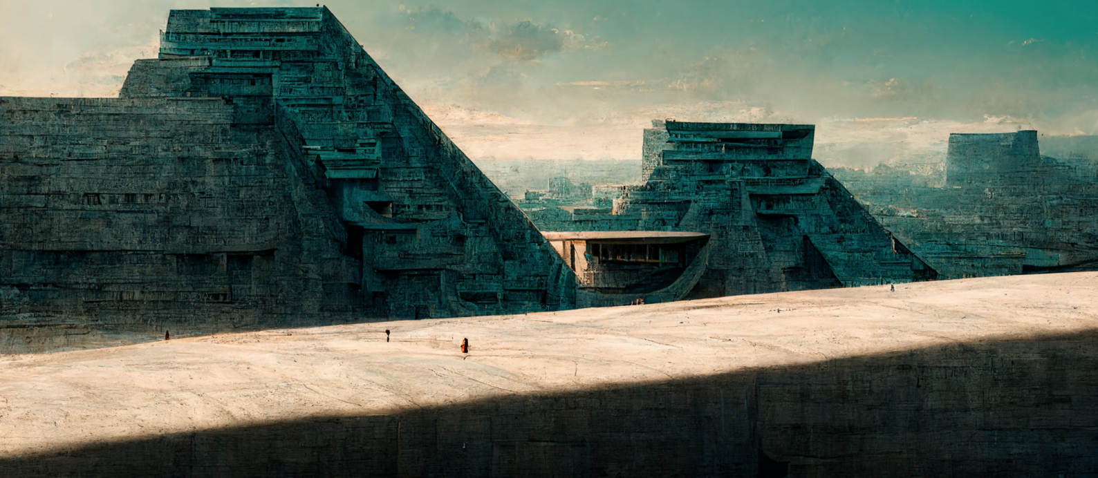
Plano Ciudad > futuristic mayan city, brutalist style architecture, mayan details, cars, concrete, minimalist, hyper realist, high details, soft morning light, view from above, aspect ratio