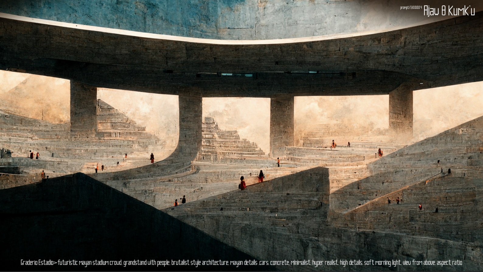
Graderio Estadio - futuristic mayan stadium crowd, grandstand with people, brutalist style architecture, mayan details, cars, concrete, minimalist, hyper realist, high details, soft morning light, view from above, aspect ratio