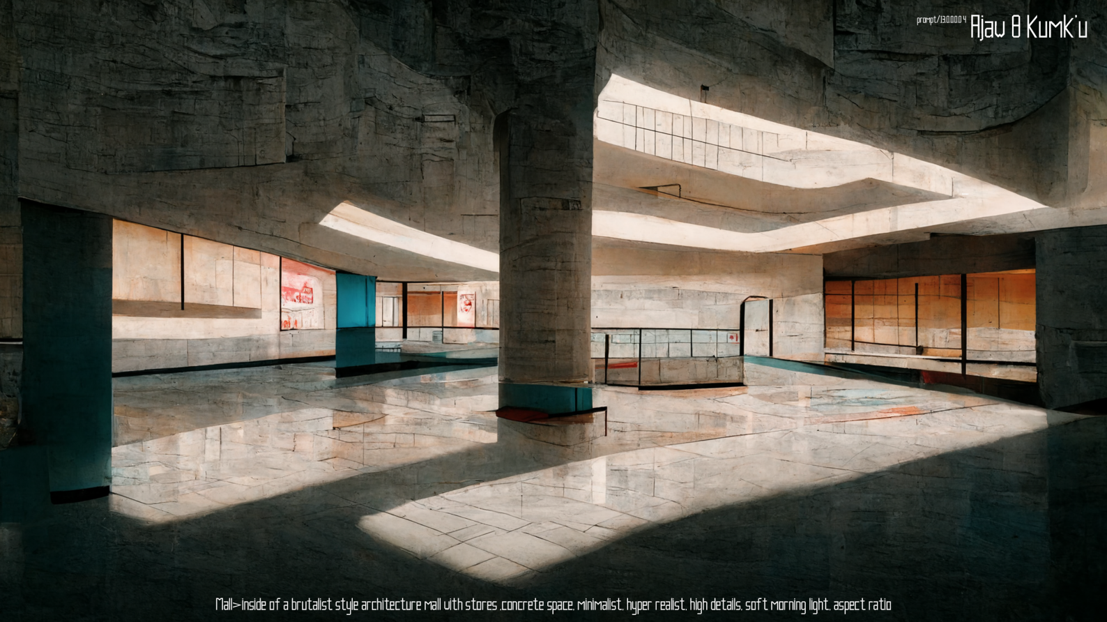
Mall > inside of a brutalist style architecture mall with stores .concrete space. minimalist. hyper realist. high details. soft morning light. aspect ratio