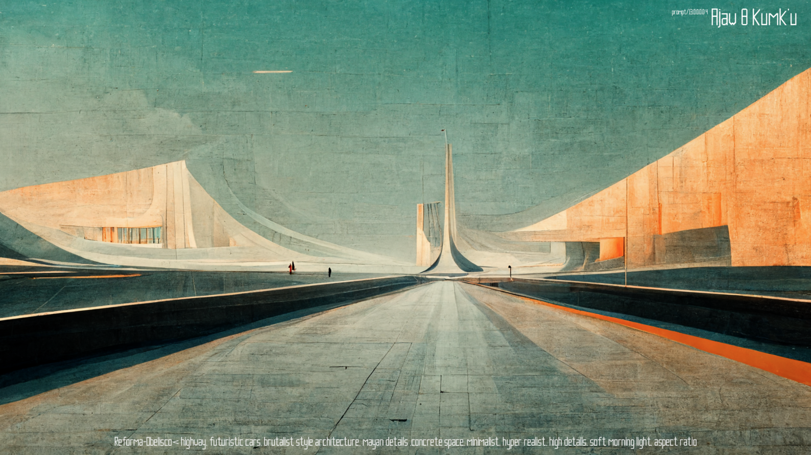
Reforma-Obelisco < highway, futuristic cars, brutalist style architecture, mayan details, concrete space, minimalist, hyper-realist, high details, soft morning light, aspect ratio