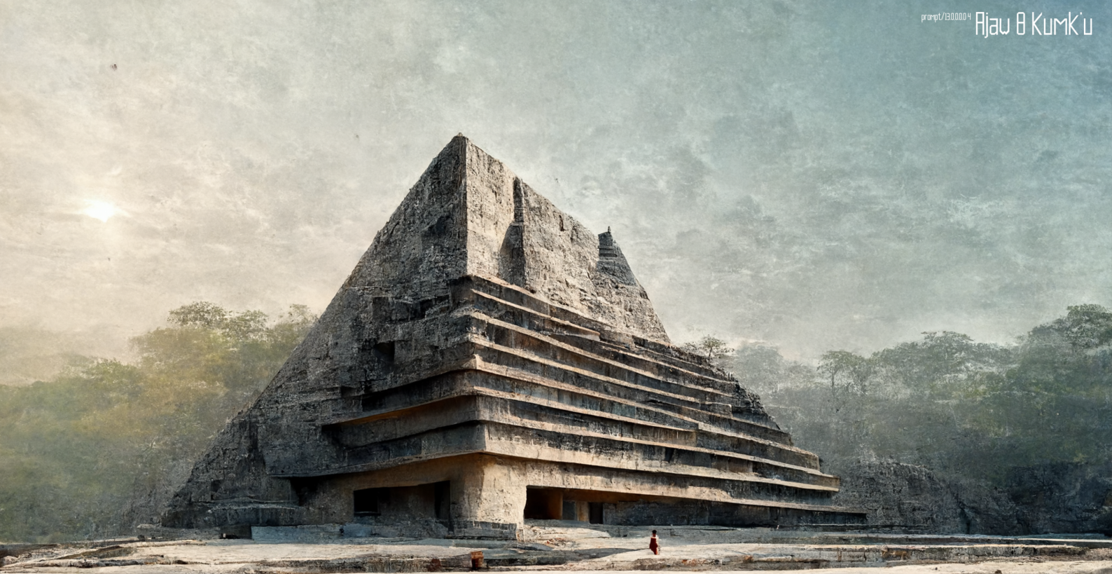
Templo - brutalist style architecture mayan pyramid. concrete space. minimalist. hyper realist. high details. soft morning light. aspect ratio