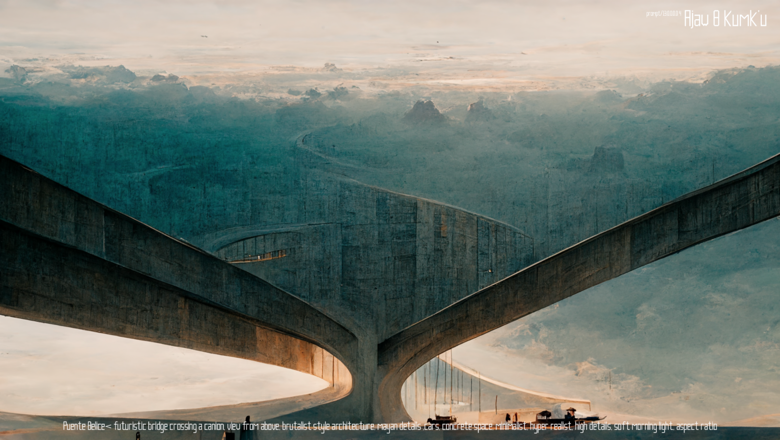
Puente Belice -> futuristic bridge crossing a canyon, view from above, brutalist style architecture, mayan details, cars, concrete space, minimalist, hyper-realistic, high details, soft morning light, aspect ratio