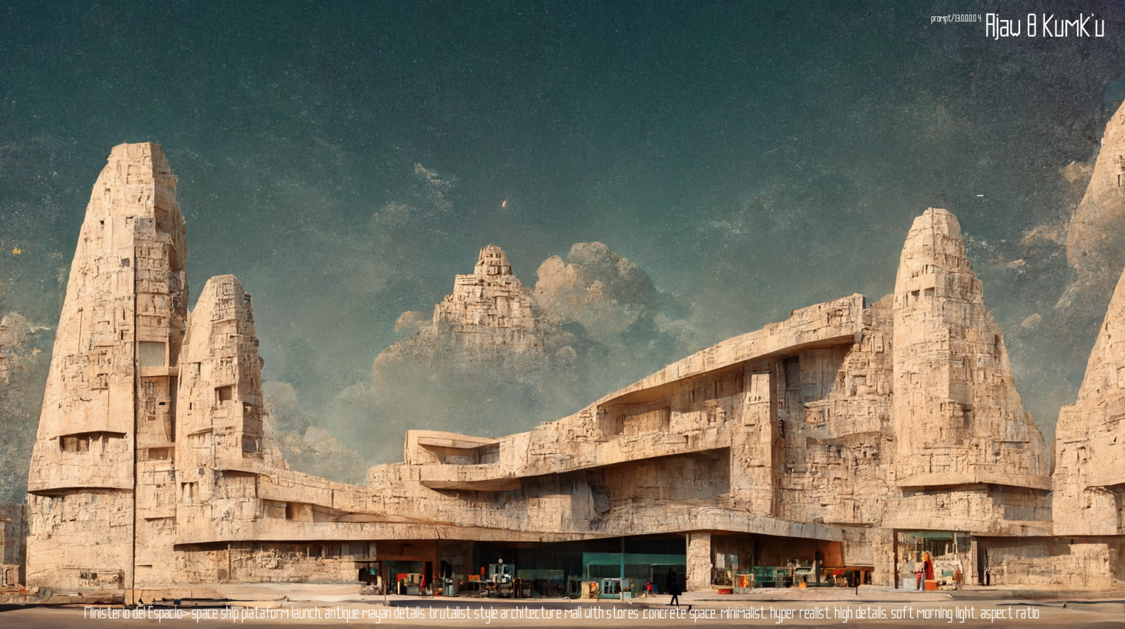
Ministerio del Espacio - space ship platform launch, antique mayan details, brutalist style architecture mall with stores, concrete space, minimalist, hyper realist, high details, soft morning light, aspect ratio