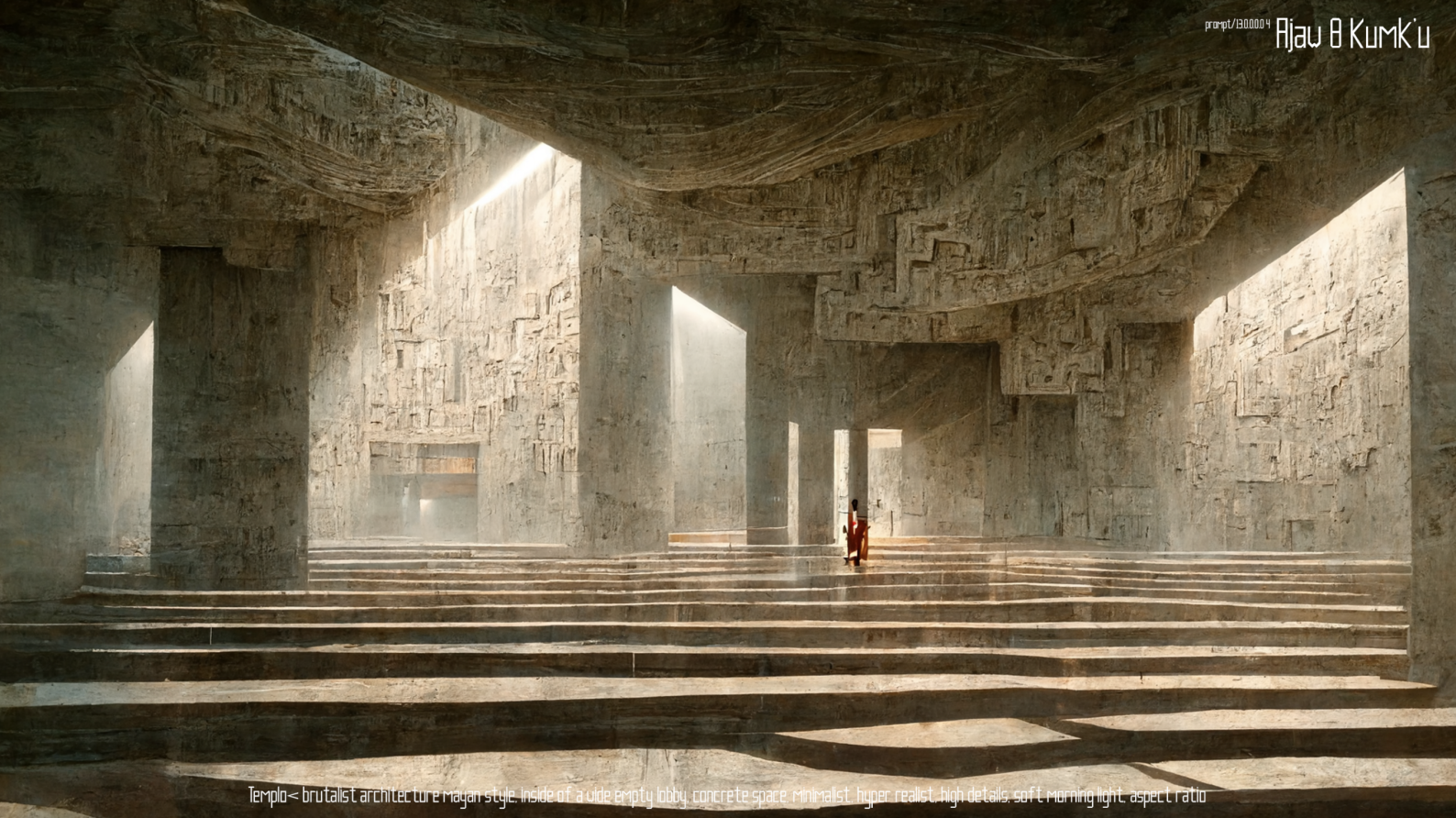
Templo - brutalist architecture mayan style. inside of a wide empty lobby. concrete space. minimalist. hyper-realistic. high details. soft morning light. aspect ratio