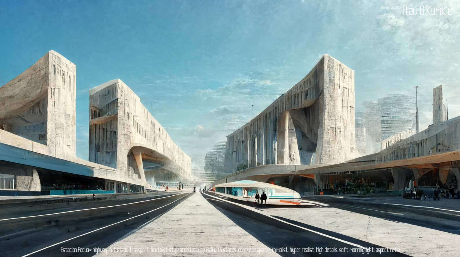
Estación Fecua > highway, futuristic, transport, brutalist style architecture, mall with stores, concrete space, minimalist, hyper-realistic, high details, soft morning light, aspect ratio