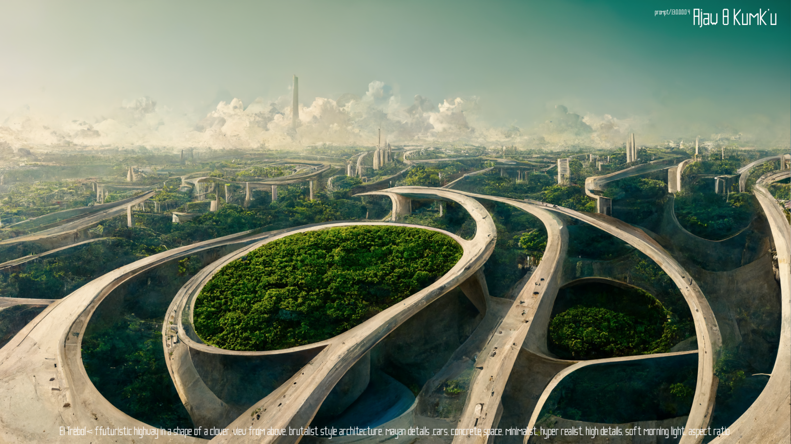
El Trebol - futuristic highway in a shape of a clover, view from above, brutalist style architecture, mayan details, cars, concrete space, minimalist, hyper realist, high details, soft morning light, aspect ratio