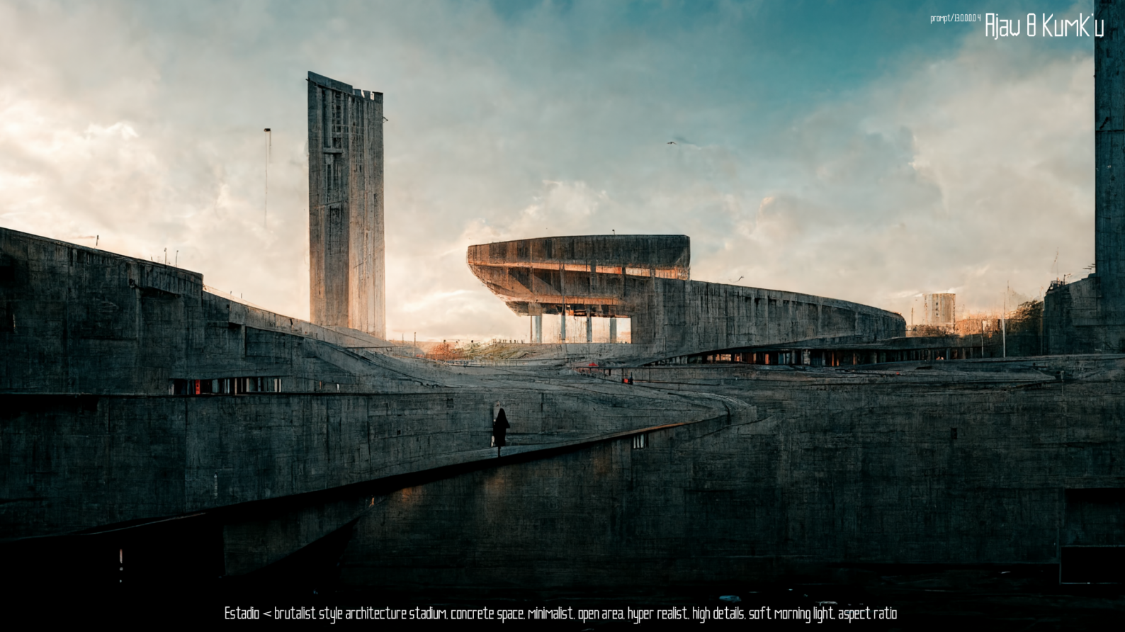
Estadio -> brutalist style architecture stadium, concrete space, minimalist, open area, hyper realist, high details, soft morning light, aspect ratio