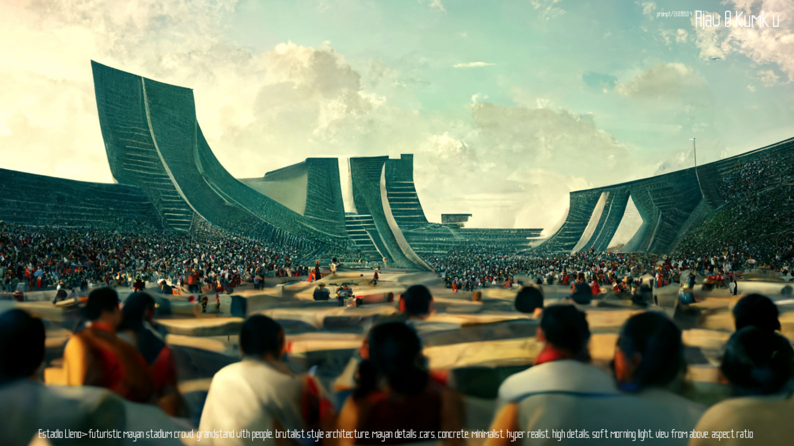
Estadio Llano - futuristic mayan stadium crowd, grandstand with people, brutalist style architecture, mayan details, cars, concrete, minimalist, hyper realist, high details, soft morning light, view from above, aspect ratio