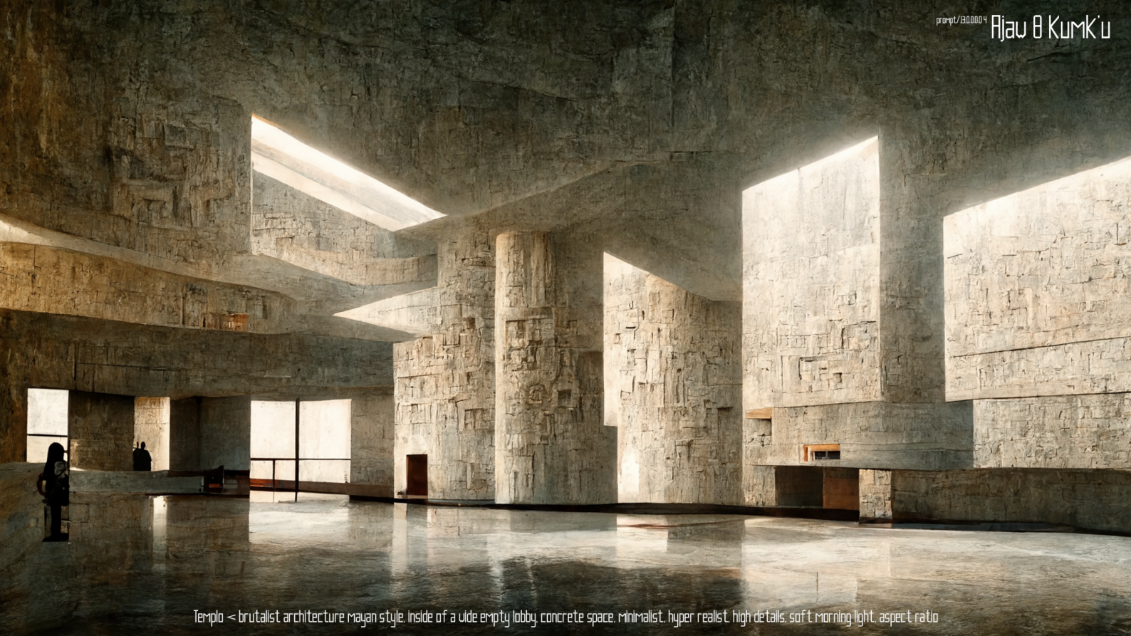
Templo < brutalist architecture mayan style. Inside of a wide empty lobby, concrete space. minimalist, hyper realist, high details, soft morning light, aspect ratio