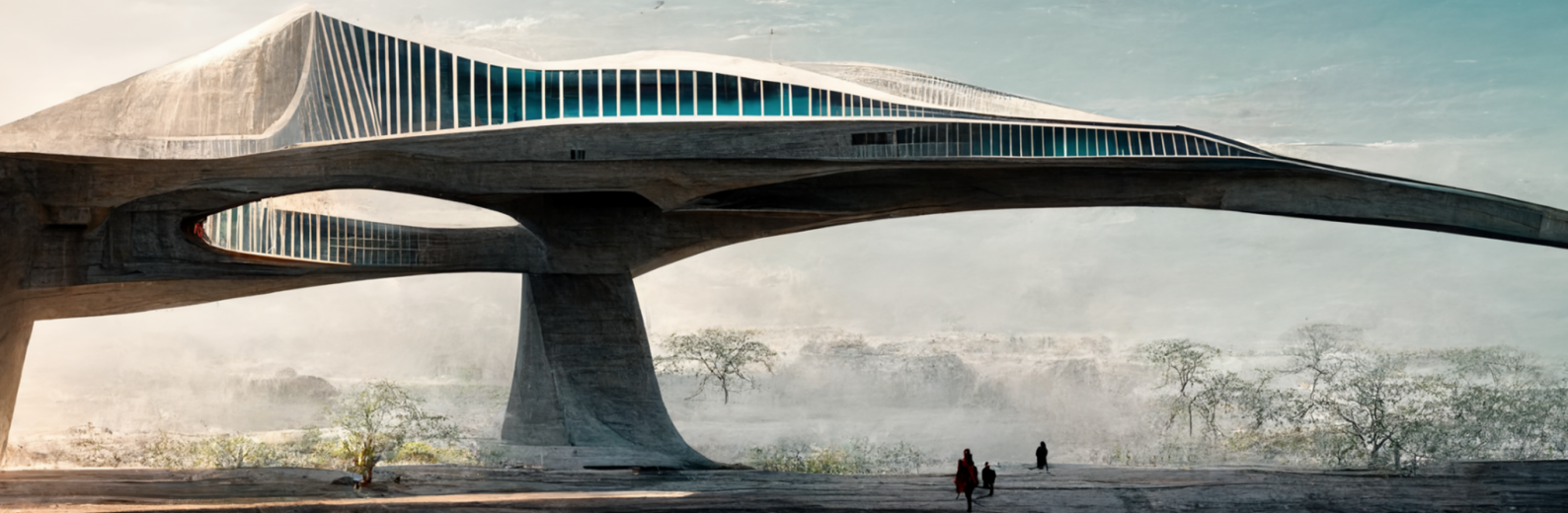
Puente Incienso < futuristic bridge icrossing a canyon, brutalist style architecture, mayan details, cars, concrete space, minimalist, hyper realist, high details, soft morning light, aspect ratio