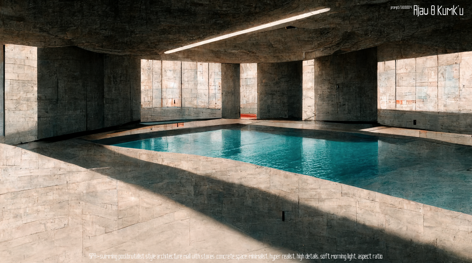
SPA - swimming pool brutalist style architecture mall with stores concrete space minimalist hyper realist high details soft morning light aspect ratio