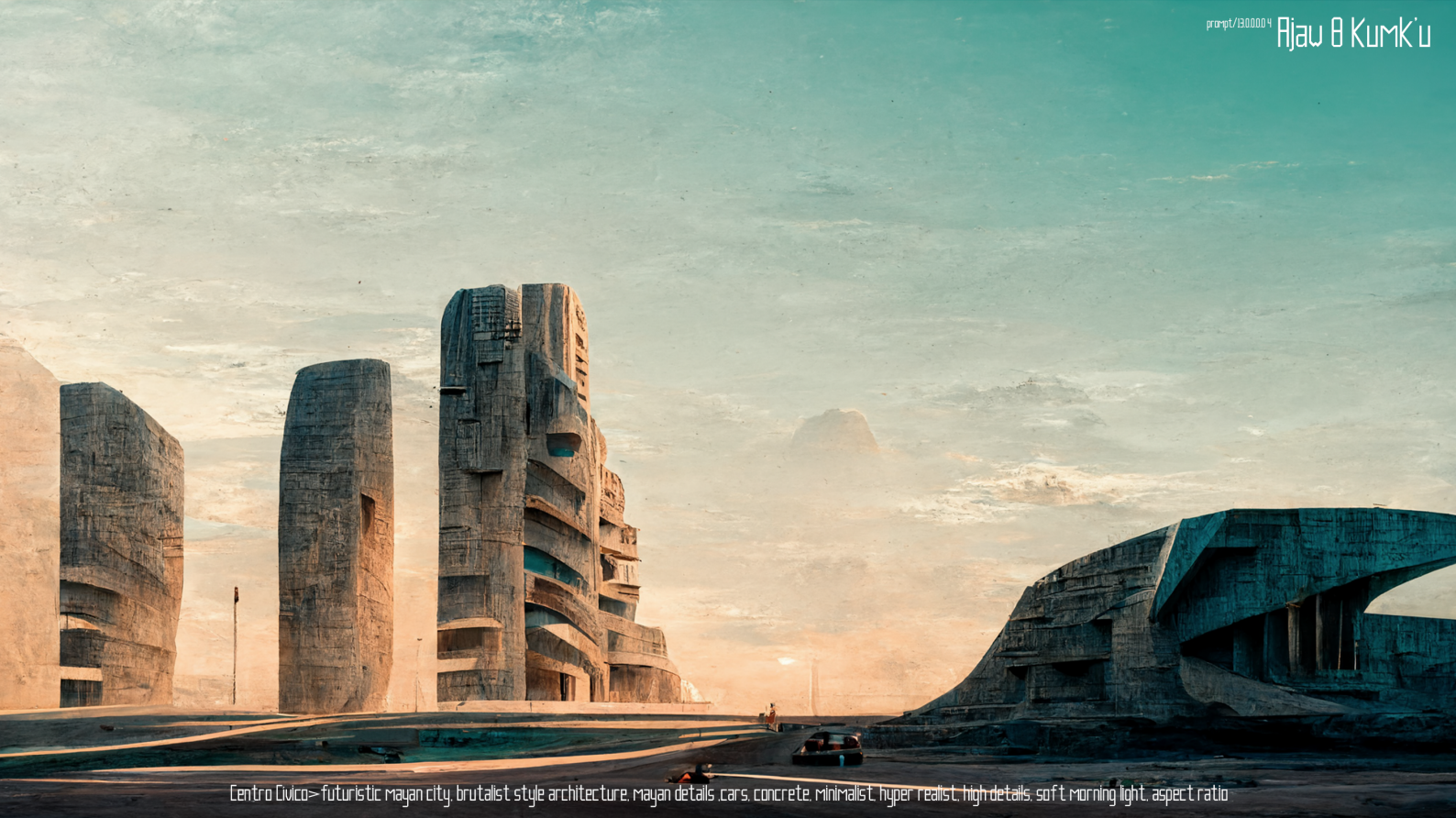
Centro Civico > futuristic mayan city, brutalist style architecture, mayan details, cars, concrete, minimalist, hyper realist, high details, soft morning light, aspect ratio