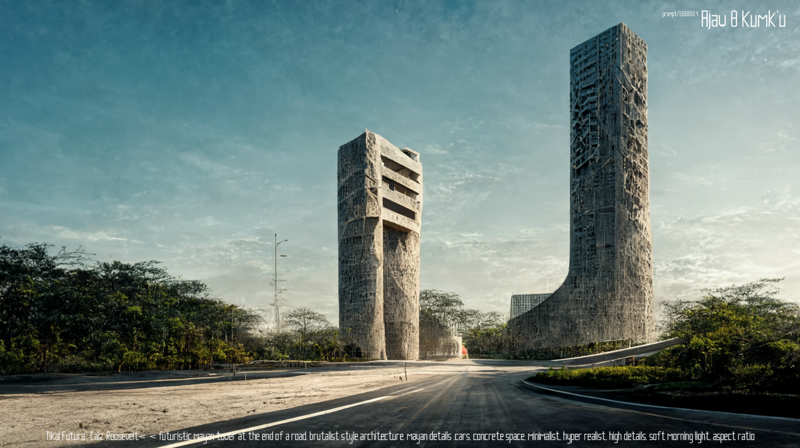
Tikal Futura: Calz. Roosevelt << futuristic mayan tower at the end of a road. brutalist style architecture. mayan details. cars. concrete space. minimalist. hyper realist. high details. soft morning light. aspect ratio